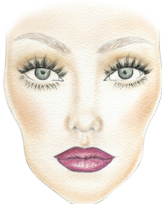
FALL IN LOVE