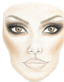
THE SMOKE OUT